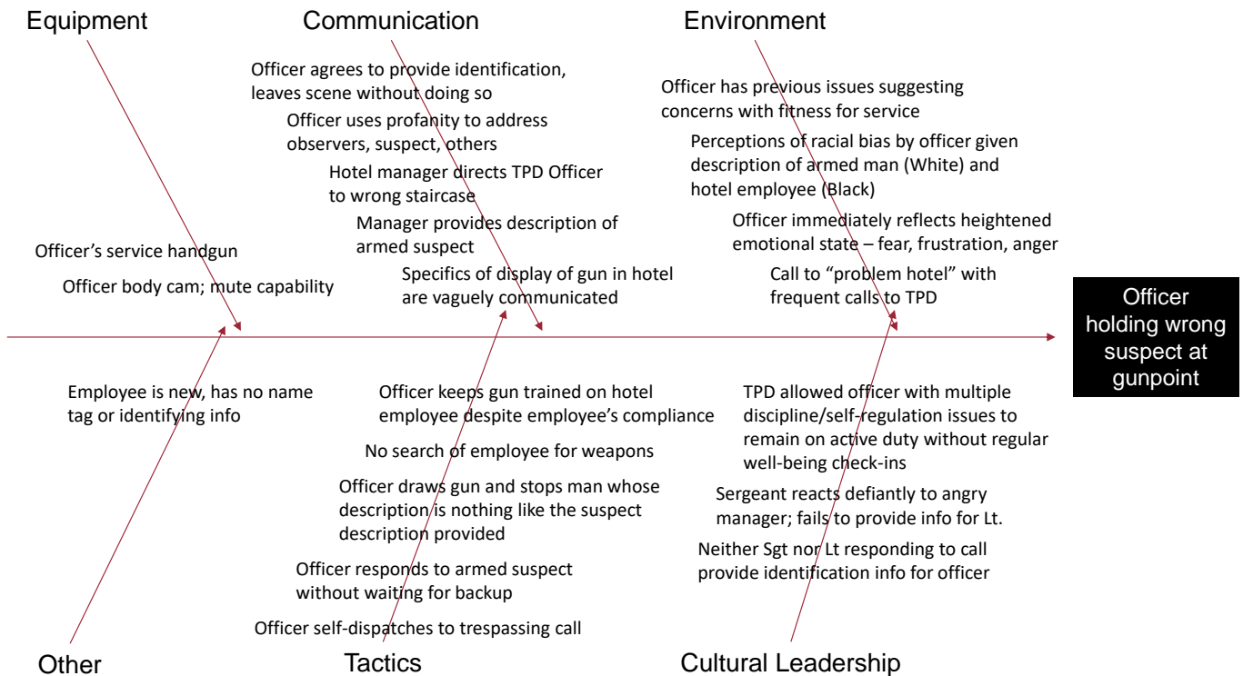
Figure 4. Fishbone diagram showing Contributing Factors to the Sentinel Event.

he was going on vacation the next day, which had the effect of causing both the Manager and the Employee to react with cynicism and the belief that the investigation was not going to be timely or viewed as important. The Manager saw this to be a consistent disregard of his complaint about the responding Officer’s actions, particularly in conjunction with his rebuffed request in his second call to TPD dispatch requesting a lieutenant to be sent to the scene and his poor interactions with the Sergeant.