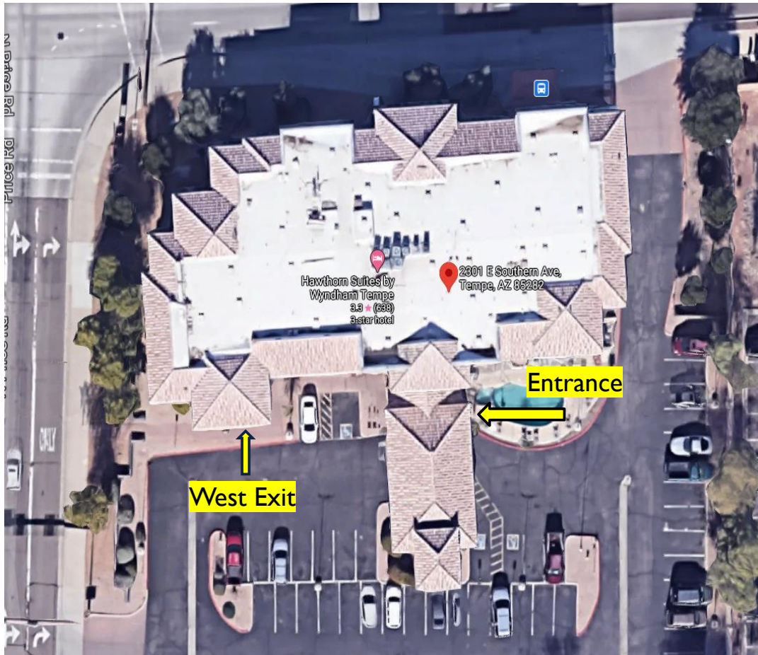
Figure 2. Aerial photo of Hawthorn Suites with west exit identified.

The Officer stated into his radio that he was proceeding to the west exit, and the Manager’s voice can be heard on the officer’s BWC saying that the suspect would be walking out of the exit at that moment.